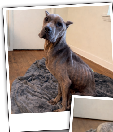
Stone was merely 41 pounds when he was brought in to MACS.

Stone's story is proof of what your generosity makes possible. But it's also a reminder: another Stone will need us tomorrow. Please consider making a gift today so we can be there when the next life depends on it. Thank you for giving dogs like Stone the chance to heal — and the chance to belong.