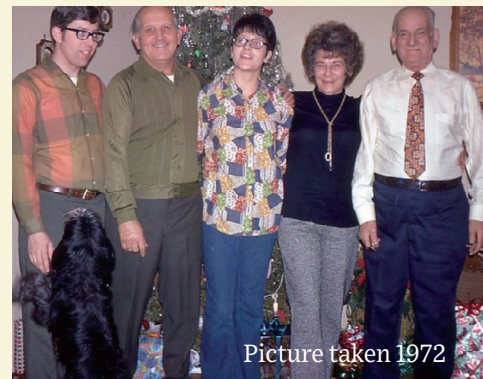
Picture taken 1972

We lovingly hold both members of the MACS family in our hearts.