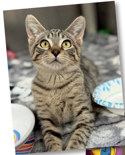
Tanny was a bundle of joy!

Your donations allow us to step in for kittens like Tanny—providing critical medical care and turning uncertainty into a forever home. 🐾